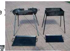
← Left, BBQ Table ( Large )