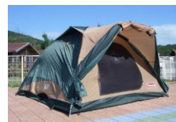
← Tent ( Large ) Dome