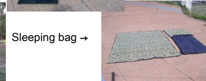
Sleeping bag →