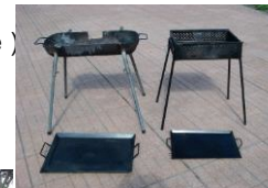
← Left, BBQ Table ( Large ) ← Right BBQ Table ( Small )