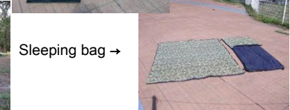
Sleeping bag →