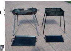
← Left, BBQ Table ( Large )