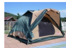
← Tent ( Large ) Dome